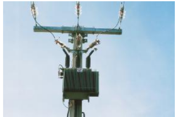
"TPC" 100 kVA overhead substation on Electricité De France networks. Transformer pole mounted by hanging-up arrangements, with live connection bushings and built-in protection - cut-out function.

Powers are limited to 50, 100 and 160 kVA; two LV feeders are therefore economically optimal. The proposed solution combines the advantages of the integration of a protection - cut-out function with the possibilities of live work offered by specially designed resin bushings.