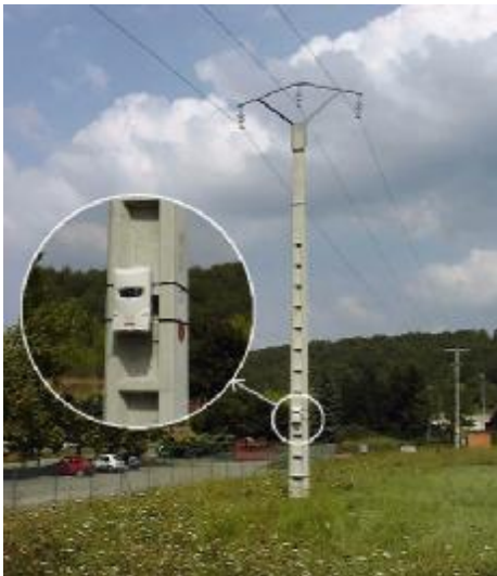
Directional fault detector in overhead version: a major component in the general system for improvement of supply quality

As the current of the defective MV feeder may present a value lower than the purely capacitive currents passing through the healthy ones, a new generation of detectors based on comparison of the phases, in transient state, between current and voltage according to their position upstream or downstream from the fault, replaces the old models based on current measurement.