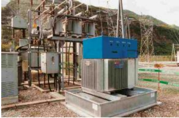
Example of machine in service, sized for neutral currents between 80A and 600A in 40A steps, applied for 10 seconds. A minimum active component of 20A is always retained to ensure the functioning of the current protections.

3-3-1) Step-tuned Arc Suppressing Coil, adjusted by means of vacuum contact breakers, actuated by a monitoring and control system linked to a system of permanent examination of the network