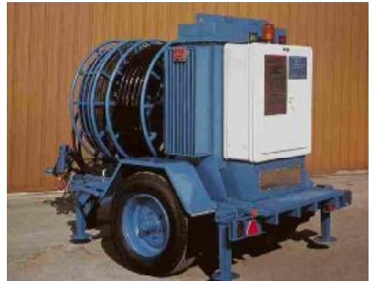
Complete version used by Electricité De France centres. The pre-cabled transformer and cabinet assemblies can be supplied separately for later assembly.

Action in the field will be a decisive complement to the upstream corrective measures. For this purpose, mobile substations on trailers enable rapid interventions in complete safety. The TAPIR (Temporary Power Supply Transformer) comprises a 400 kVA transformer, an attached cabinet containing protections and controls, together with the cable drums