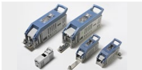
Fuse holder solutions 22x58, T00,T1,T2,T3 with or without protection IP2X