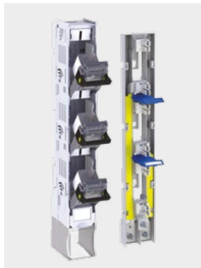
DIN fuse ways