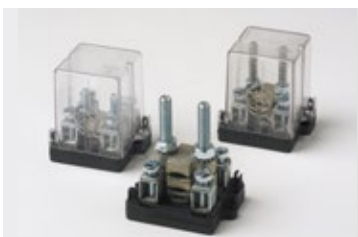
Lead terminals for sections 6-240² copper and aluminum