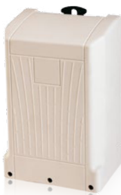
1 or 2 pairs Ref. 0802.221